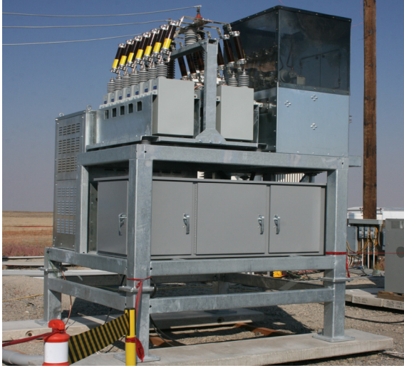
Figure 1 - Photo of the SolidGround™ Transformer Neutral Blocking System